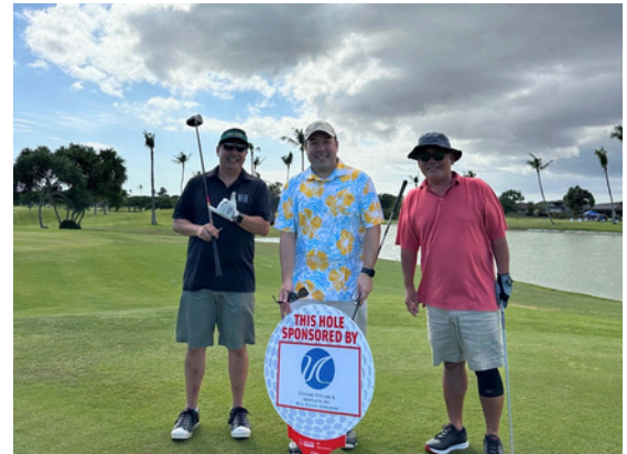
Good times all around.