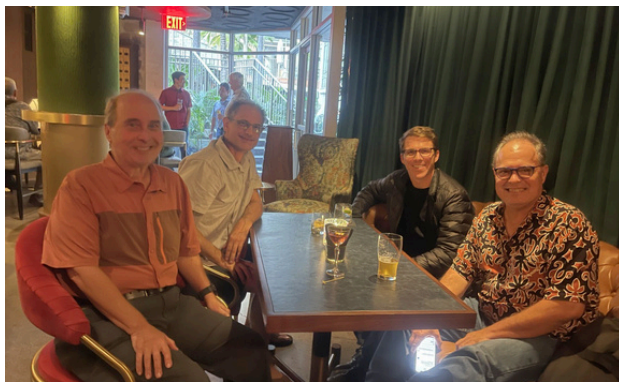
Pau hana at Yours Truly at the AC Marriott.