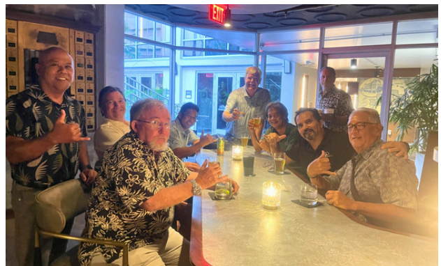
Cheers to a successful symposium!