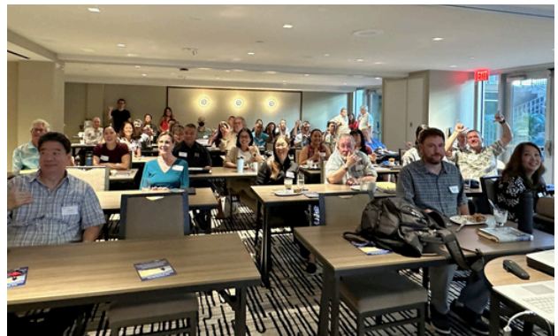
Shakas at the symposium!