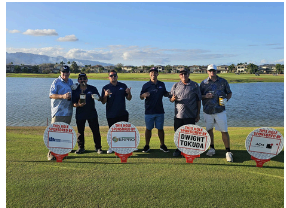
A perfect day for golf!