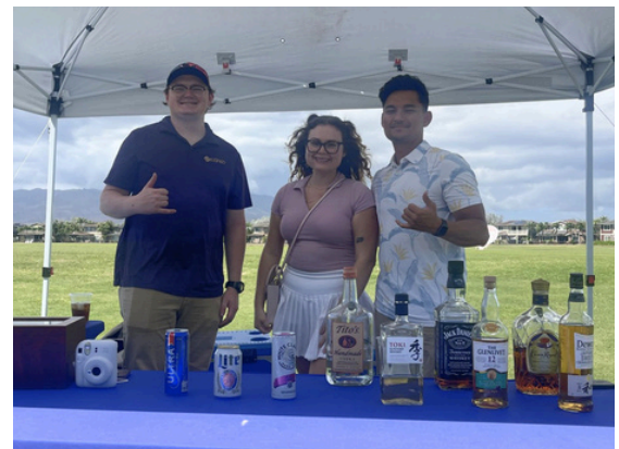
Sponsor Enpro keeping our golfers well-nourished on the course!