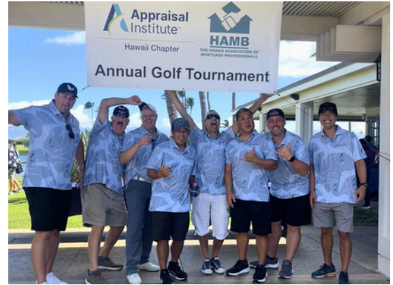
Celebrating a successful tournament!