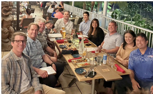
Chapter Board Members giving our speakers a warm welcome at Tiki's in Waikiki.